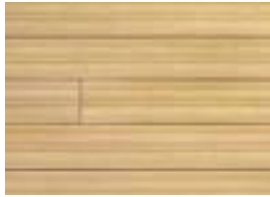
GOLDEN OAK - MDL200G