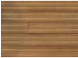
COPPERED OAK - MDL200C